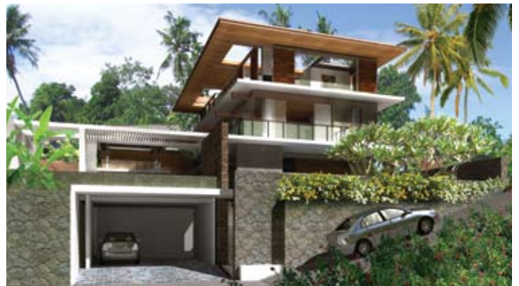
standard 2 car maxi car port with sub level storage/living quarters

with villa Royale™ the choice is yours, we offer an expansive range of options, including; finishings, appliances, landscaping, furnishings and guest suites, all of which allow you to personalize your villa experience and truly make it your home.