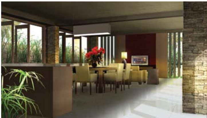
home furnishings and interior design options available upon request