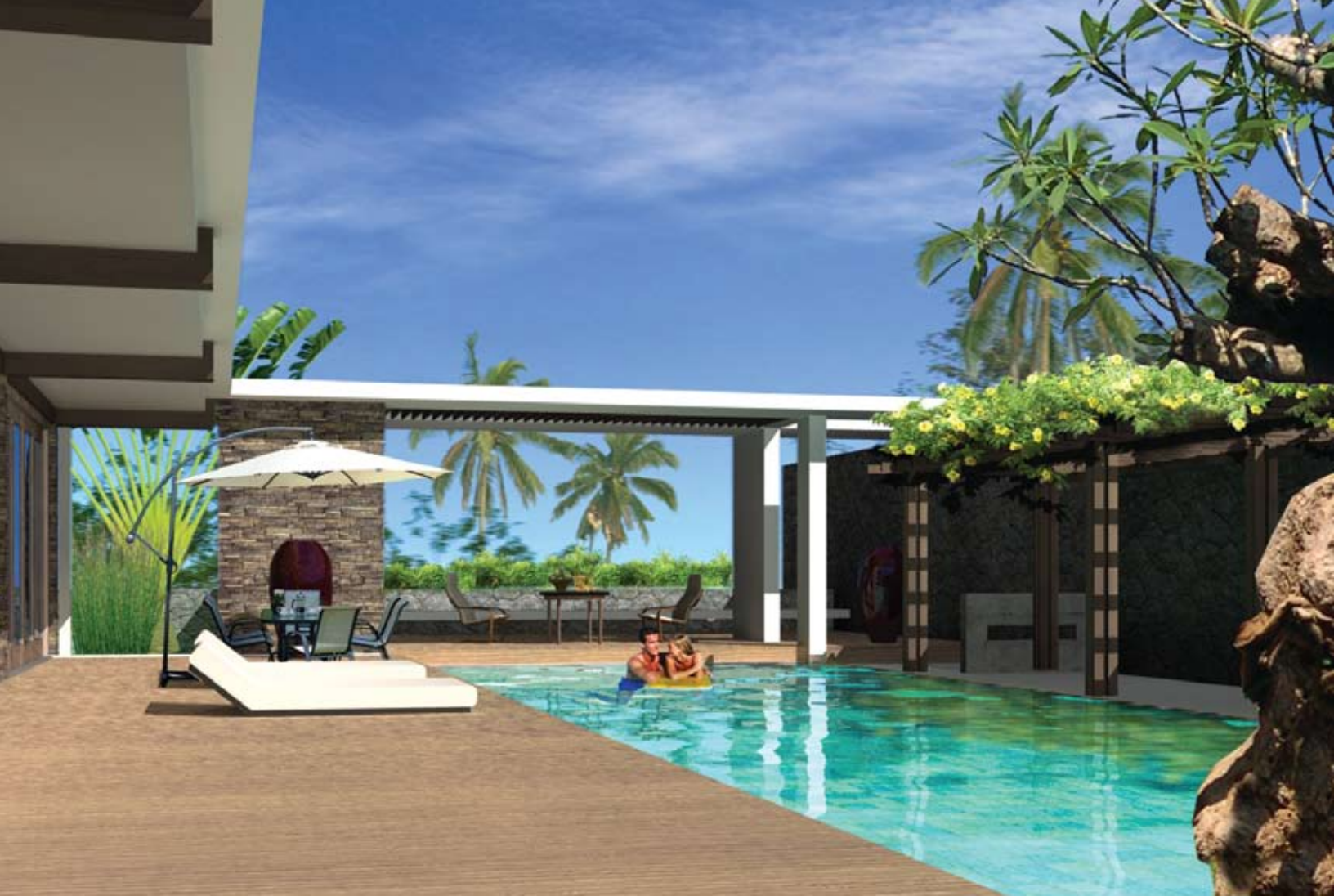
landscaping packages available in three options; tropical, tuscan and japanese